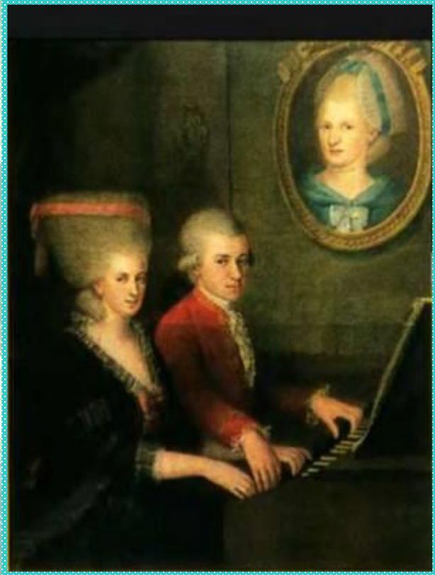
Mozart and his sister at the piano