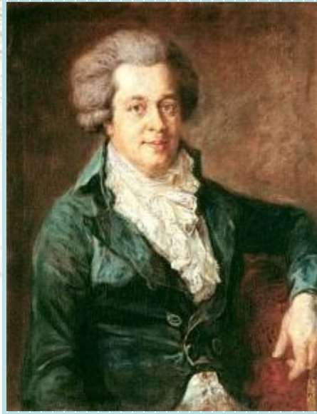
Father – Leopold Mozart