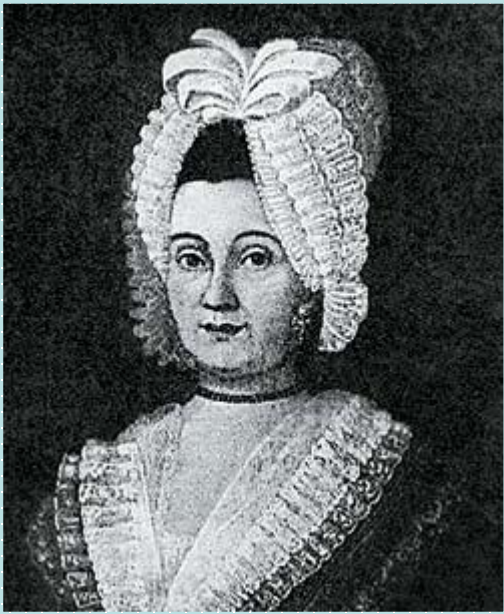
Mother – Anna Maria Pertl